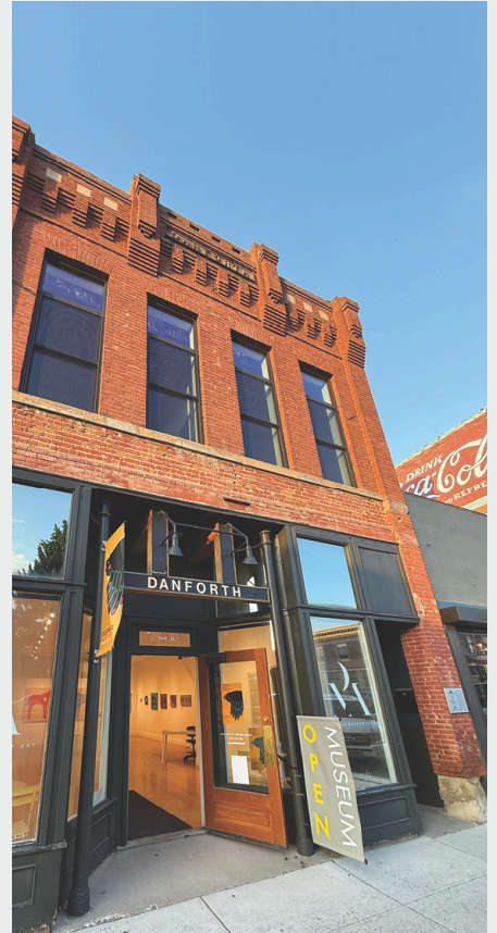
danforth museum of art

LIVE Fine Art Auction September 27, 2025