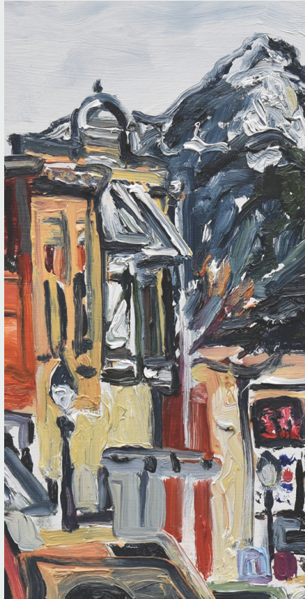
livingston center for art and culture